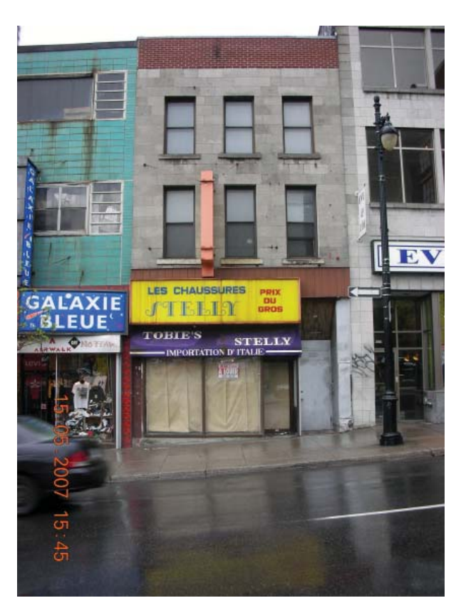
Fig. 4 Stelly Shoe Store, closed winter 2007

Branding cannot take the place of investment in real infrastructural initiatives relating to drainage, affordable housing, and transport that emphasizes pedestrian and bicycle travel. Ultimately, branding a downtown is no substitute for a well-rounded, sensitive, socially and ecologically relevant urban design intervention. A last question is whether there is any place for the seedy part of downtown? Arcade Fire one of the city's cultural exports, began in the informal clubs in downtown Montréal. Branding seems to play a game of musical chairs.