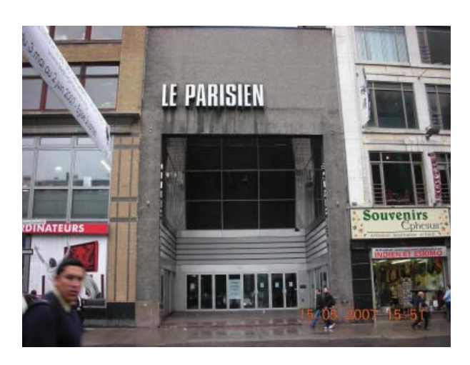
Fig. 4. The Le Parisian Cinema, closed summer 2007.

mental music venue and sound art gallery. In the flesh-eating tradition of competing venues, these fine new music halls rendered Le Spectrum obsolete – or at least that was a perception.