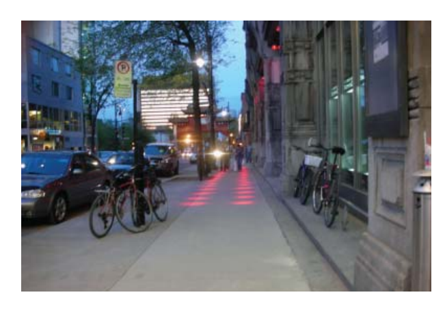
Fig. 3, Sidewalk Lighting Strategy, Boulevard Saint Laurent.

tréal Jazz festival criticized of the proposed loss of empty lots used for temporary staging for the festival. In the light of the proposed new building projects, Jazz festival director Alain Simard inserted an editorial in the 2007 schedule of events, asking where the festival would take place in the coming years, once its downtown performance sites were built over.