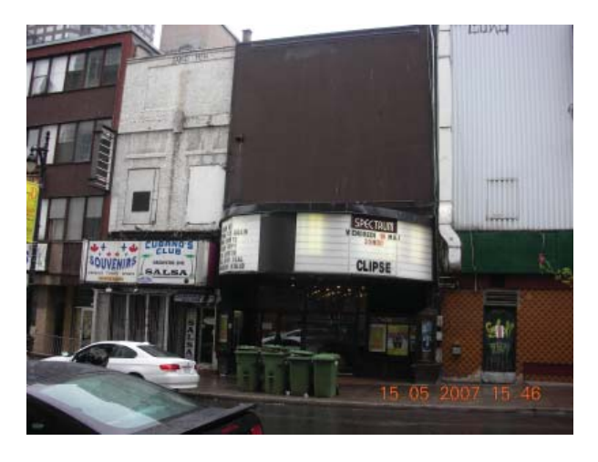
Fig. 1. Le Spectrum, live music venue, closed summer 2007.

In observing the Quartier des Spectacles , or Theatre District in Montréal, although the distinctive quality of the somewhat rundown entertainment district was clearly identified as a concentration of venues for live music and evening diversion, two pivotal venues have closed. It seems like a step backward.